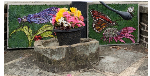
Two gorgeous nature-themed panels for well dressing at Greenhill Village Pump

For more (and bigger!) photos, please follow us on Facebook or Instagram. There's just not enough space here!