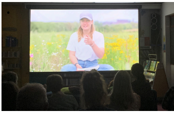
A showing of the film 'Six Inches of Soil' about regenerative farming