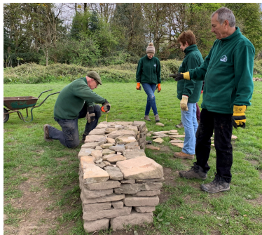
A dry stone walling project of four benches in Stone Cross Field, by a BEG working group.

Some of the local activities we linked with, supported with funding, played a part in or simply celebrated are shown below: