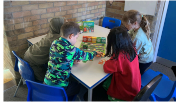
Working with Greenhill Primary pupils on their Environment Day